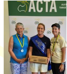
Liz Ladies OA 100T Commonwealth

Benn didn't stop there this year taking out a 3 rd in AA in Skeet doubles along with A Grade High Gun